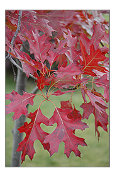
Northern Pin Oak in fall