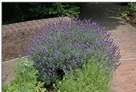
English Lavender in bloom

English Lavender is recommended for the following landscape applications;