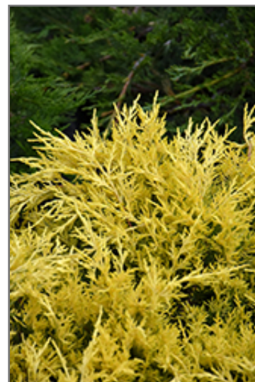
Sea Of Gold Juniper foliage