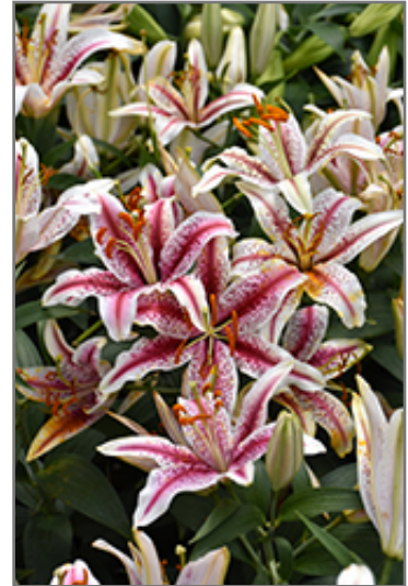
Dizzy Lily flowers