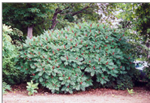
Smooth Sumac in bloom