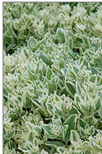
Frosty Morn Stonecrop foliage