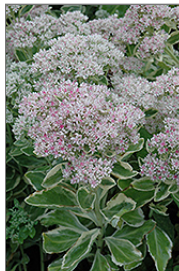
Frosty Morn Stonecrop flowers