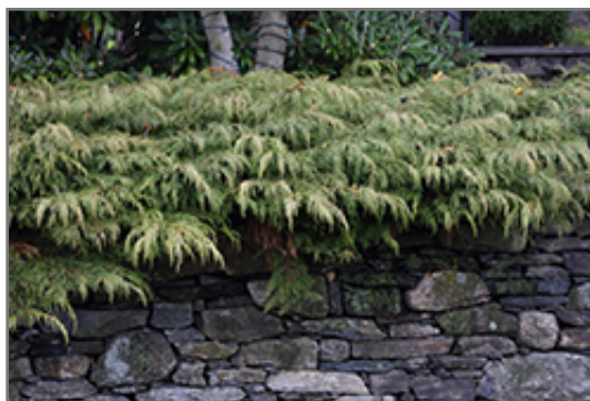
Russian Cypress