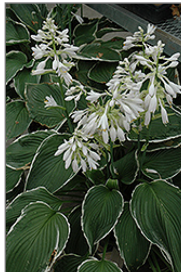
Frosted Jade Hosta flowers

Frosted Jade Hosta is recommended for the following landscape applications;