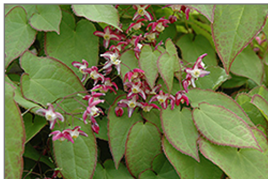
Bishop's Hat flowers

Bishop's Hat is a dense herbaceous evergreen perennial with a ground-hugging habit of growth. Its relatively fine texture sets it apart from other garden plants with less refined foliage.