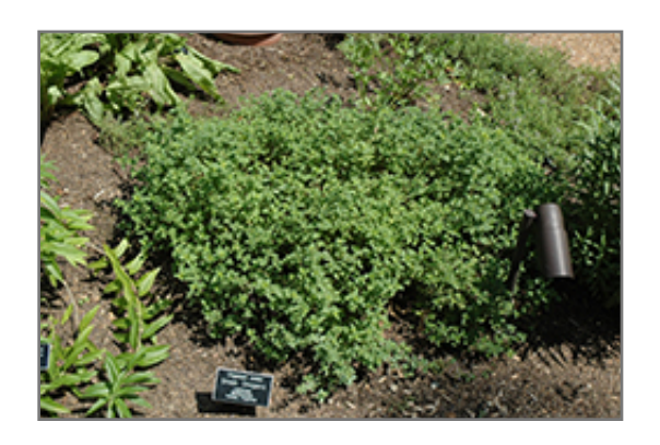
Greek Oregano

Greek Oregano will grow to be about 16 inches tall at maturity extending to 24 inches tall with the flowers, with a spread of 14 inches. When grown in masses or used as a bedding plant, individual plants should be spaced approximately 12 inches apart. Its foliage tends to remain dense right to the ground, not requiring facer plants in front. Although it's not a true annual, this fast-growing plant can be expected to behave as an annual in our climate if left outdoors over the winter, usually needing replacement the following year. As such, gardeners should take into consideration that it will perform differently than it would in its native habitat.