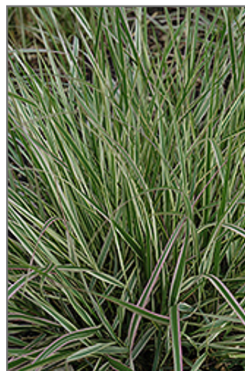
Variegated Reed Grass foliage