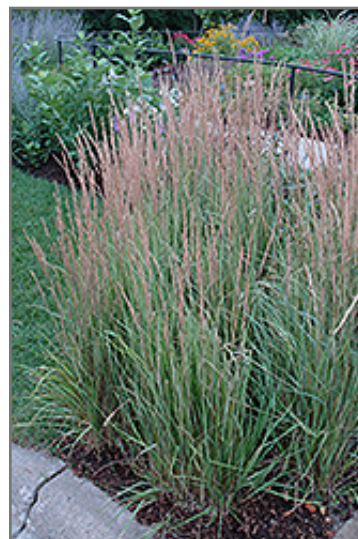
Variegated Reed Grass in bloom

This plant will require occasional maintenance and upkeep, and is best cut back to the ground in late winter before active growth resumes. It has no significant negative characteristics.