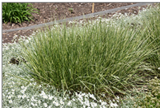
Variegated Reed Grass

Variegated Reed Grass is a fine choice for the garden, but it is also a good selection for planting in outdoor pots and containers. With its upright habit of growth, it is best suited for use as a 'thriller' in the 'spiller-thriller-filler' container combination; plant it near the center of the pot, surrounded by smaller plants and those that spill over the edges. It is even sizeable enough that it can be grown alone in a suitable container. Note that when growing plants in outdoor containers and baskets, they may require more frequent waterings than they would in the yard or garden.