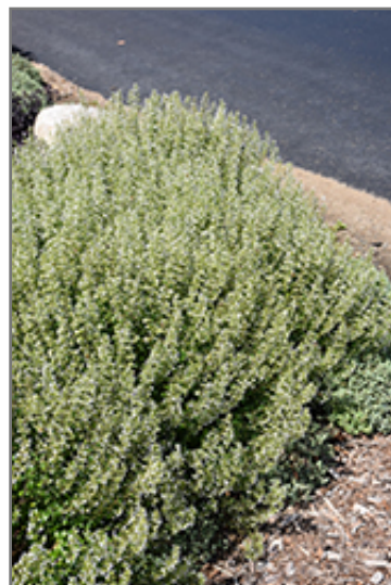
White Cloud Dwarf Calamint in bloom