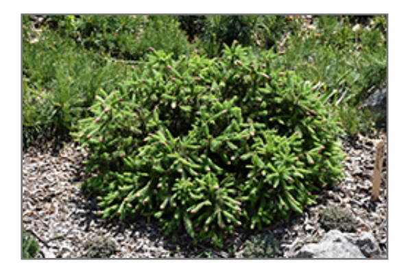
Pusch Spruce

520 Highway 1 West Iowa City, Iowa 52246 (319) 337–8351 www.iowacitylandscaping.com