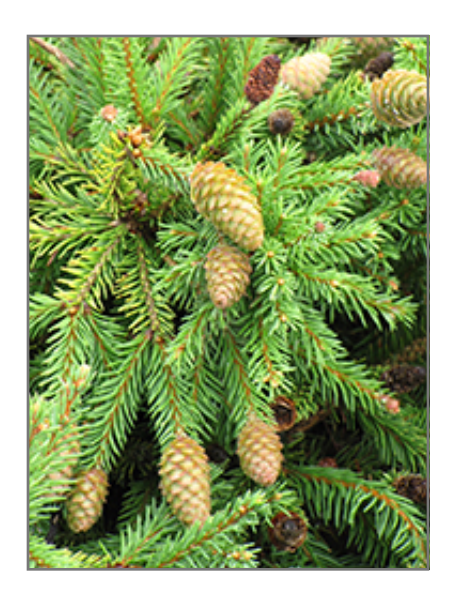
Pusch Spruce foliage