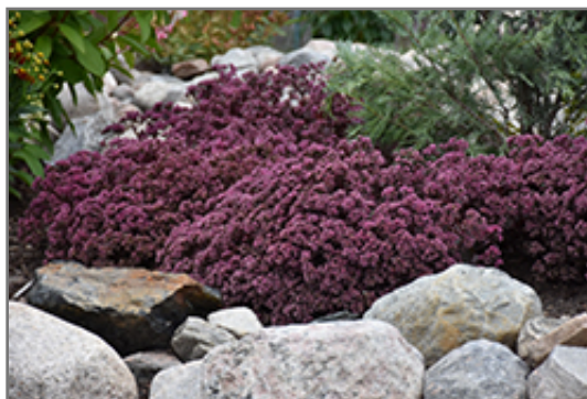
Cherry Tart Stonecrop in bloom

Cherry Tart Stonecrop is a dense herbaceous perennial with an upright spreading habit of growth. Its medium texture blends into the garden, but can always be balanced by a couple of finer or coarser plants for an effective composition.