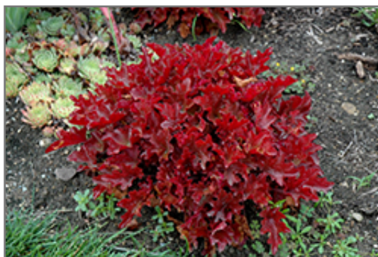
Dolce Cinnamon Curls Coral Bells