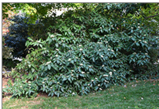
Alleghany Viburnum in bloom