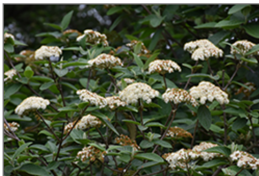
Alleghany Viburnum flowers

Alleghany Viburnum is recommended for the following landscape applications;