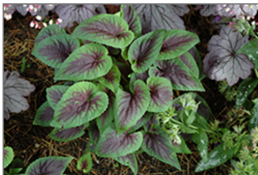
Heartthrob Violet