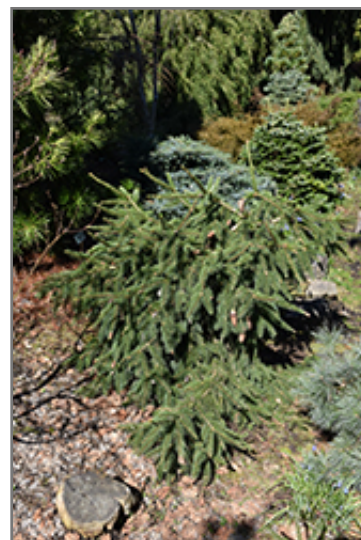
Red Cone Spruce